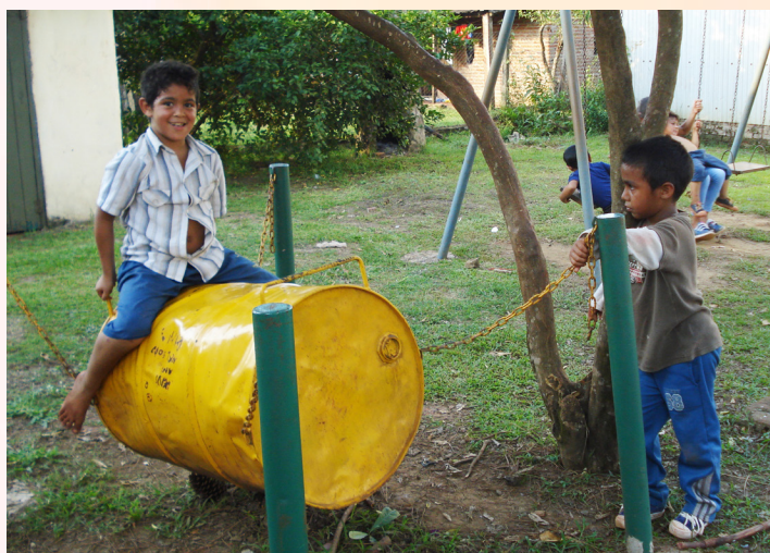
Asociacion Civil Cristiana Congregacional, Argentina, installed a playground at their mission site.