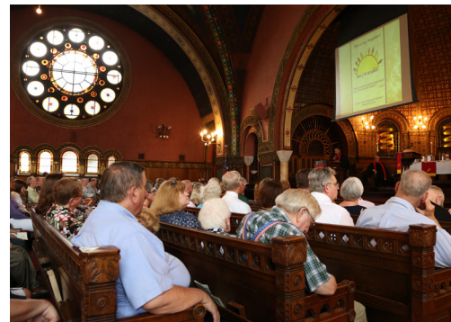
2016 Annual Meeting and Conference, Detroit/Dearborn, MI.