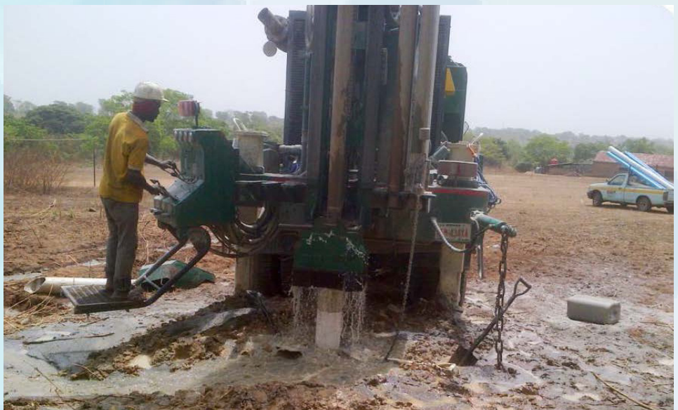
Christ to the Villages in Nigeria is drilling a borehole to alleviate the water shortage the schools in Shao are facing.

Berwick Congregational Church Cadman Memorial Congregational Church Central Congregational Church Community Congregational Church of Big Piney