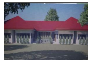
Rendition of the new Center

Christian Mission in the Far East, Philippines , is building a new Center for their office space.