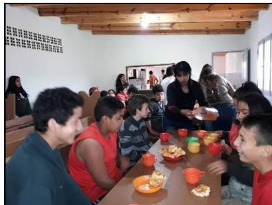
Making Pizza and having lunch in the new Kitchen/Dining Room

Asociacion Civil Cristiana Congregational, Argentina , has built a new kitchen. Next they will be working on a new dining Hall. With this new soup-kitchen, the mission will provide a Saturday meal for 200 children of the poorest families who have difficulty feeding their children.