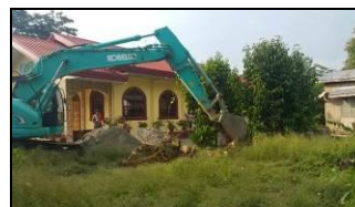
Digging for the Center