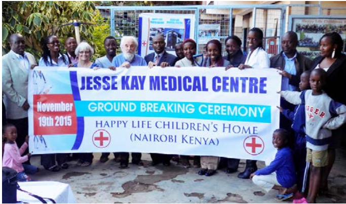
Happy Life Children's Home, Nairobi, Kenya, ground breaking ceremony for Jesse Kay Pediatric Medical Center.