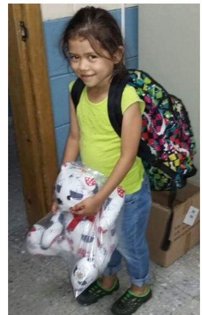
A young girl on her way home after receiving treatment at Ministerio Vida Hospital in Honduras. The hospital serves the people of San Pedro Sula and is the only hospital close to the town.