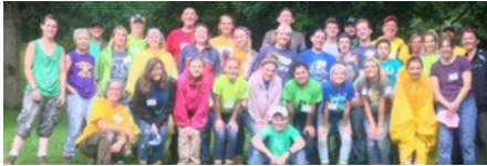
Volunteers from North Shore Congregational Church and Ozaukee Congregational Church in Wisconsin visited Hosanna Industries, June 2016. The mission, located in Pennsylvania, helps families in need repair their homes.