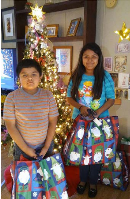
Left: Bread of Life, located in Florida, presented Christmas gifts to over fifty children. The Mission's purpose is to provide social services that serve the physical, material, and spiritual needs of families in Plant City, Florida