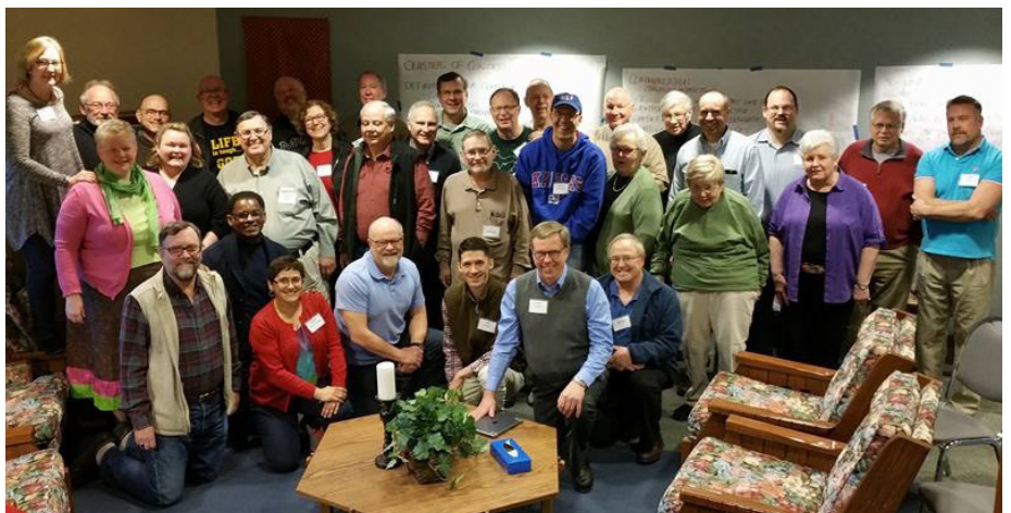
The 47 th Annual Ministers' Convocation, took place April 5–7, 2016, in Adrian, Michigan. Participants focused on "The Problem with Puzzles," learning about how to connect their church as an institution with their spiritual missions.