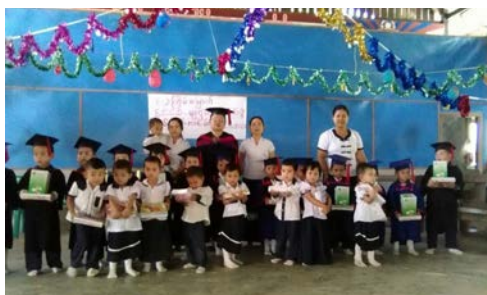
Above: Children at Grace Children’s Ministry in Myanmar graduation ceremony. The mission educates children from early childhood through high school. The program is a part of the Congregational Church of Myanmar, who is committed to preaching the Word through local churches.

Agape Church of Prayer Amelia Christian Church Ashby Congregational Church Beacon Congregational Church* Becket Federated Church Campton Congregational Church Center Congregational Church of Atlanta Central Congregational Church of La Mesa Church of The Oaks* Congregational Christian Fellowship Church Congregational Church of Canton Congregational Church of Menifee* Congregational Church of Mount Dora*