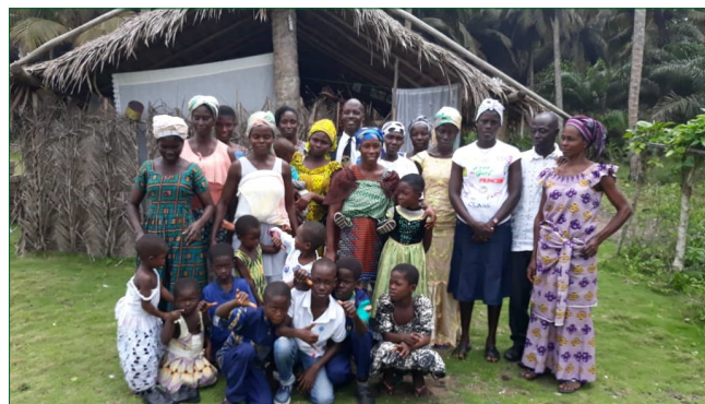
Two new churches added to the ministry of Word Alive Mission, Ghana.