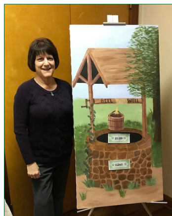
The "Bell Well", a new well soon to be dug for the Mission School of Hope supported by the Grace Church of Columbiana, OH.