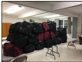
Packaged & ready to go

To help Puerto Rico, Florence Congregation Church, in Florence MA, started a campaign to send 1000 water filtering units by Christmas. These filters, called Family Life Straw water filters provides a family 18,000 liters (4755 gallons) of clean drinkable water and requires no batteries. These units were packed in duffle bags for transport. With the help of many people, their goal was reached. This work will continue into 2018 and they expanded to sending batteries and solar radios with USB ports.