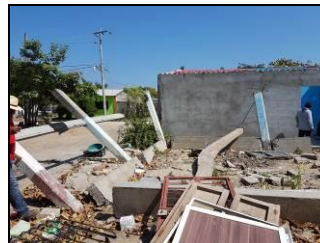
Devastation in Mexico

handy at construction, doctors and nurses. They plan to do another trip in the spring.