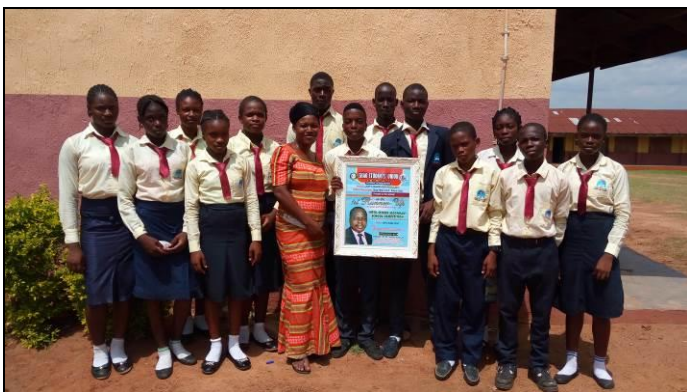
Omega College Shoa staff receiving an award