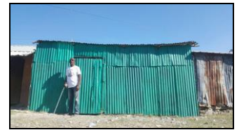
Mercy Location gets new look

Love Worth Sharing, Haiti , has started a new feeding program and school at the "Mercy" location in Port-au-Prince. It will make a huge difference in the lives of children with disabilities.