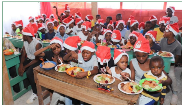
Above Right: Love Worth Sharing children's Christmas party