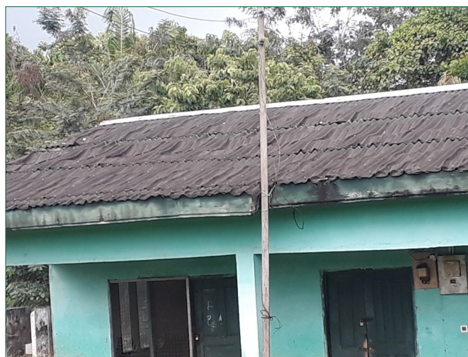
School roof repairs needed