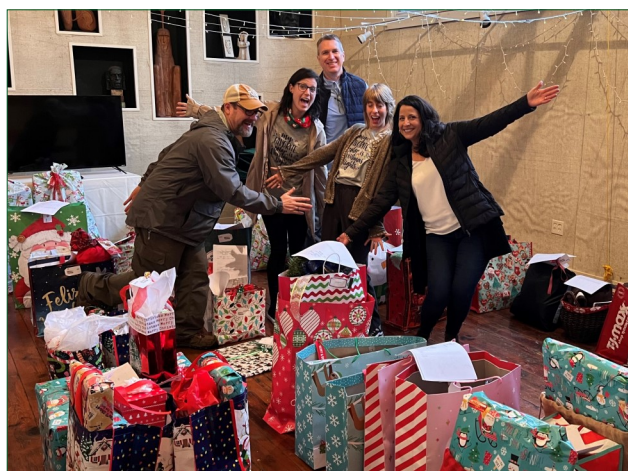
Hosanna gift delivery, ready to go