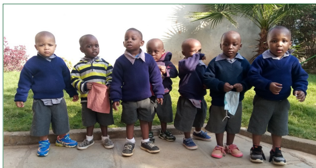
Above: Ready for school at Happy Life