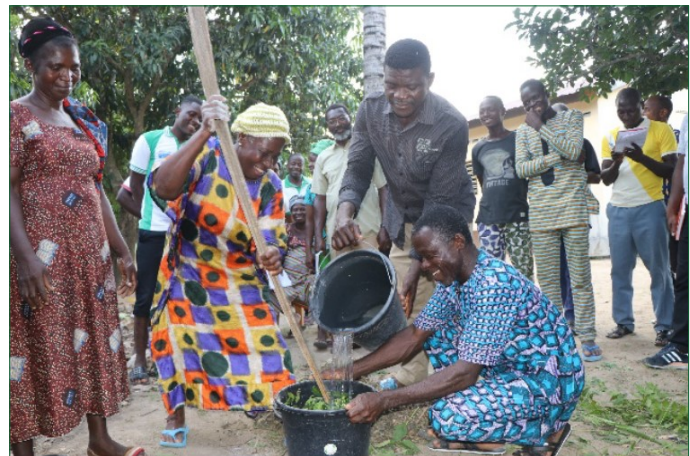
ECHO Florida, Equipping Bible School students and pastors to provide for their families