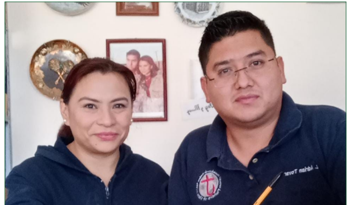
Above: Fishers of Men, preparing for the crusade