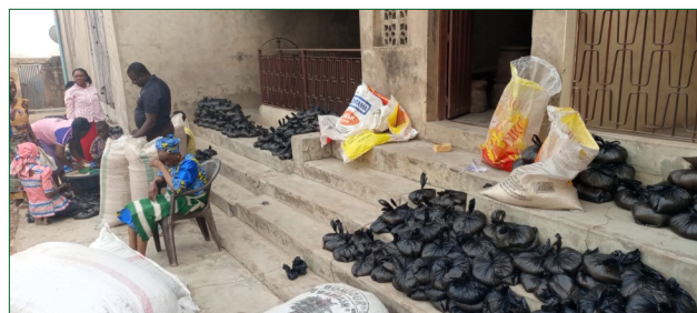
Christ to the Villages Christmas Provisions