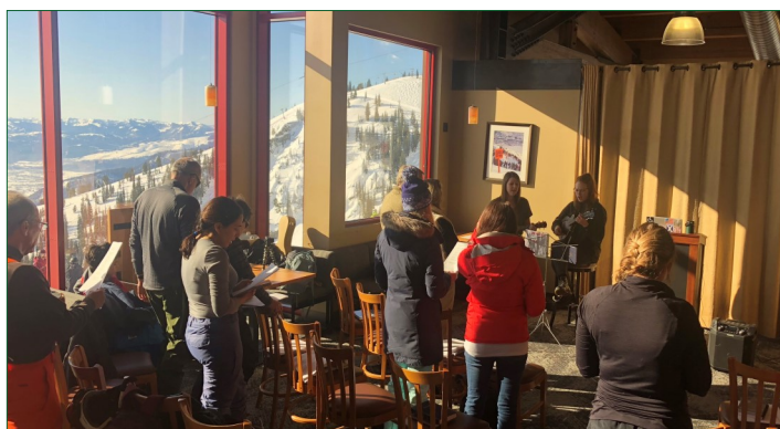
Above: A Christian Ministry in the National Parks Jackson Hole Mountain Resort Team Worship