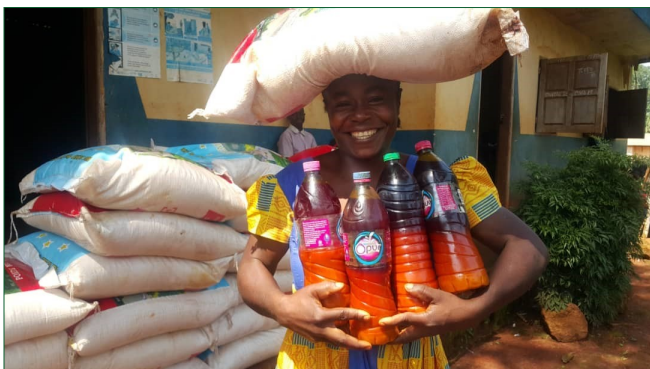
Mission School of Hope food support