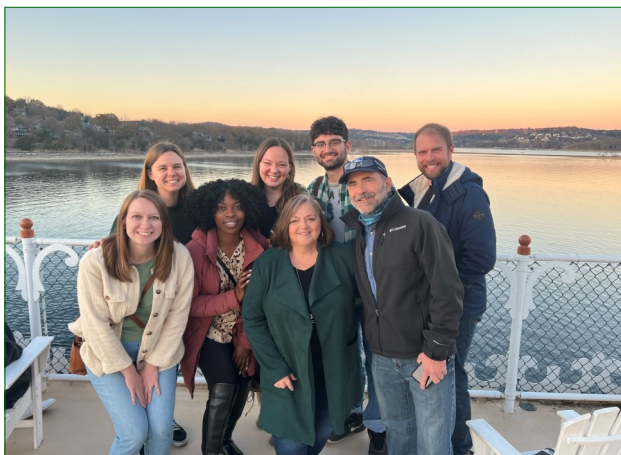
ACNMP Staff Retreat