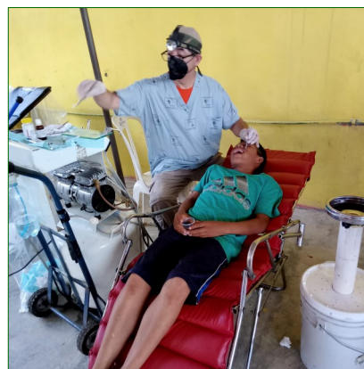
Much needed dental attention