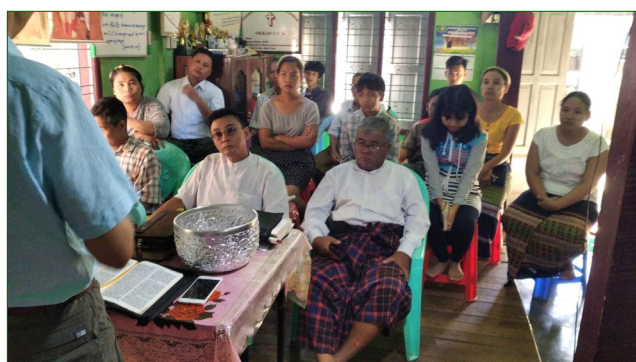
Okkan Home Church