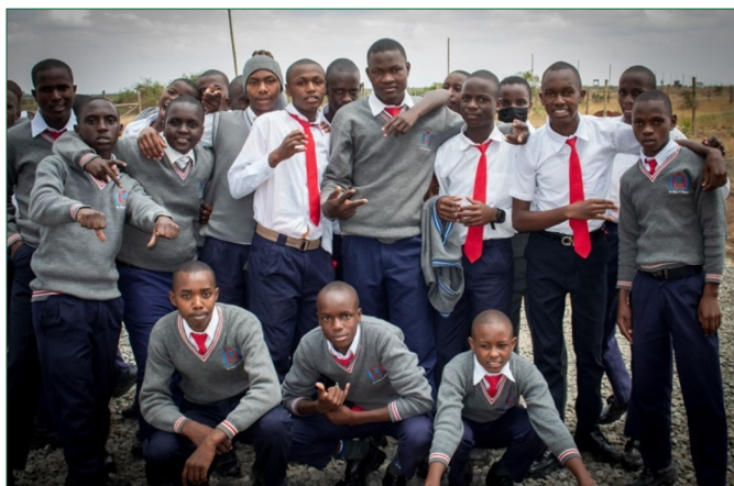
School boys having fun!