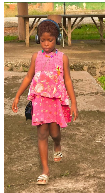
Exploring her new home