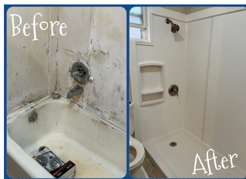
Home repairs for families in need