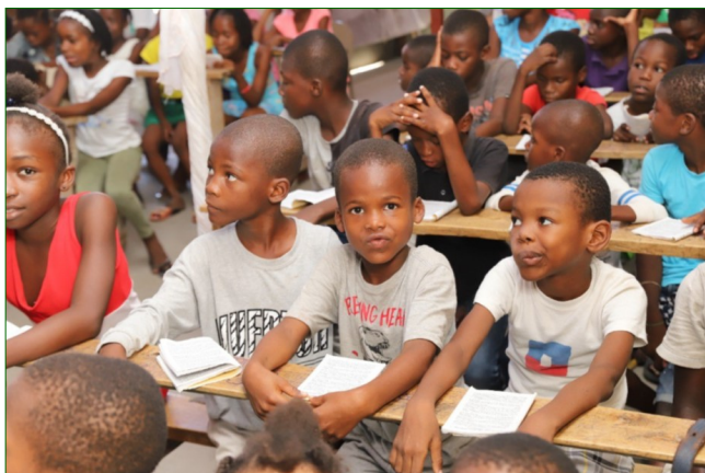
Little boys learning