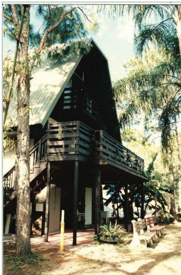
The next era of the A-Frame!

When ECHO began work in Florida, one of the first buildings to be constructed was the A-Frame, completed in the 1970's by United Methodist volunteers. The building was the heart of ECHO's ministry throughout the 1980's, housing offices, the Seed Bank, and small apartments. We are excited for the next era of the A-Frame! Work has begun to remodel the building to include high-capacity downstairs kitchen – making cooking and cleaning for groups more efficient and cost-effective. The second floor will offer bunkhouse-style accommodations for larger groups who want to serve and learn, but do not currently have space at ECHO's campus. We are looking for donations of used (but excellent condition) kitchen fixtures.