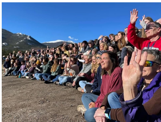
ACMNP Team Members