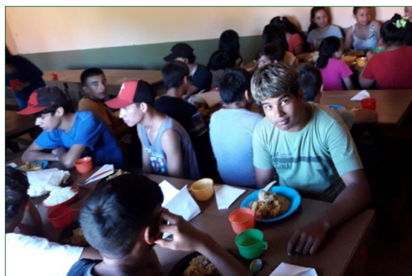
Providing a safe gathering place for young people