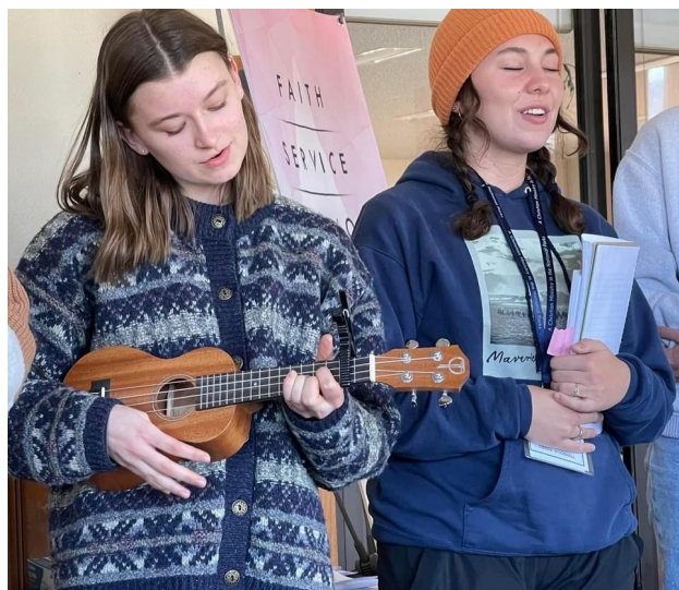
ACMNP Team Members