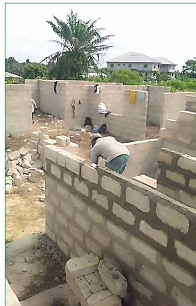
Mission Retreat House

complete the work on the toilet facility being built, now that the roof is completed. We are continuing renovations at the Christian School building block which will be followed by painting. The construction of the superstructure of the hospital and the construction of the Mission Retreat House continues. We at the mission are grateful for the many prayers and support of the NACCC/MOMC which empowers us to pursue activities and programs. Lives are being touched and blessed of the Lord. Facebook page: Word Alive Mission-Ghana & Ivory Coast