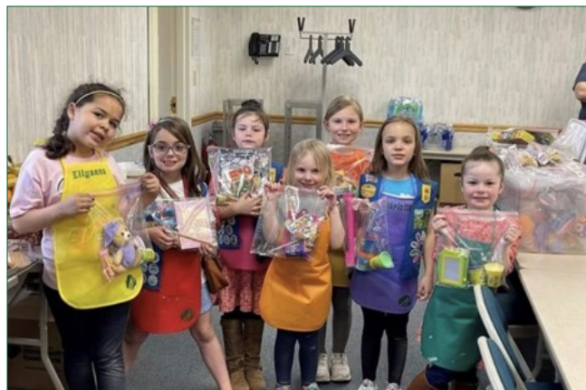
Daisy Girl Scout Troop with items for women and children