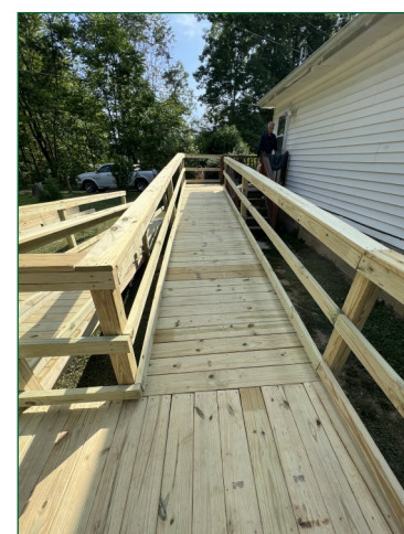
Newly constructed ramp at Morgan Scott Project