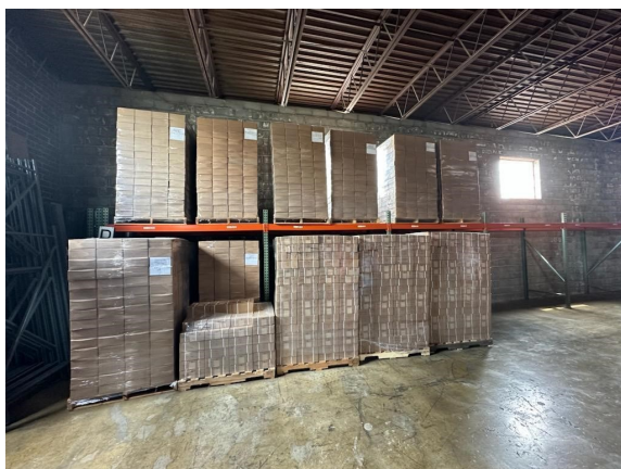
Scripture booklets awaiting shipment to Haiti